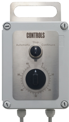
55-C0158/TIME Control panel with 1-minute timer